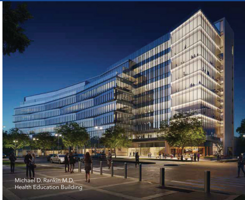
Michael D. Rankin M.D. Health Education Building

Expanding behavioral health services and opening Kentucky's first emergency psychiatric center .