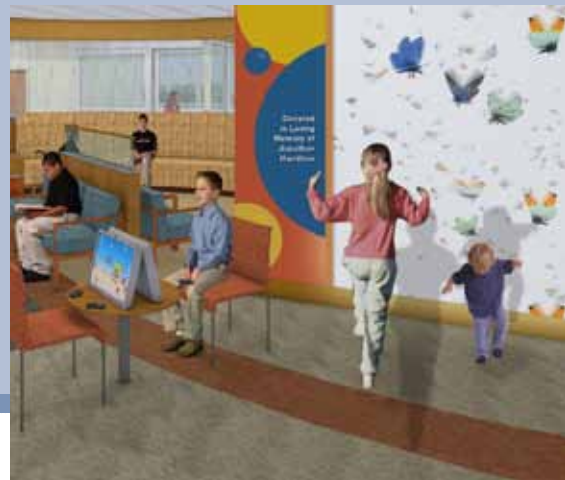
The new Makenna David Pediatric Emergency Center features waiting and treatment areas dedicated to the care of children.

On July 14, a brand new and expanded Makenna David Pediatric Emergency Center opens. See the back cover for details about the many improvements it will offer.