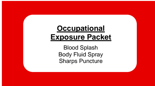
Exposure Packet for University of Kentucky Students

Notify your supervisor immediately in instances of exposure to body fluids or infectious disease. The preceptor shall complete the applicable Exposure Packet and follow procedure as outlined by the office of Infection Prevention and Control (IPAC). Also, immediately notify the appropriate contact with your home institution so additional procedures can be followed as outlined by your home institution. For students, it is highly advised to understand exposure protocols before beginning a practicum.