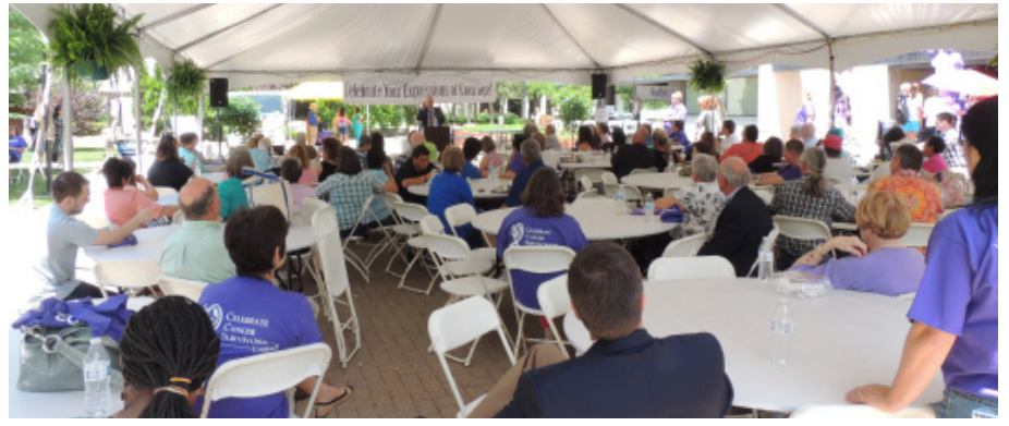
The Expressions of Courage Survivor Arts Celebration is for all cancer survivors and their loved ones.